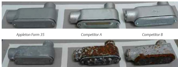
Before and after photographs. Above photo are new conduit bodies and below photo shows same conduit bodies after 42 days in salt fog chamber

To demonstrate just how durable our triple-coat finish is, we asked Intertek, a nationally recognized 3rd party testing laboratory, to subject one of our iron products, in this case our Appleton Form 35 conduit bodies, to a salt fog chamber test per ASTM B-117 standard. To prove the effectiveness of our triple-coat finish we also tested equivalent iron conduit bodies from our top two competitors in this space. This test shows the relative corrosion resistance of the specimens visibly, but is not designed to evaluate product functionality. See emerson.com for full test results and additional information.